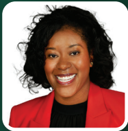
NAR CEO NYKIA WRIGHT

FEATURING EXCLUSIVE GUEST SPEAKERS FROM THE NATIONAL ASSOCIATION OF REALTORS®